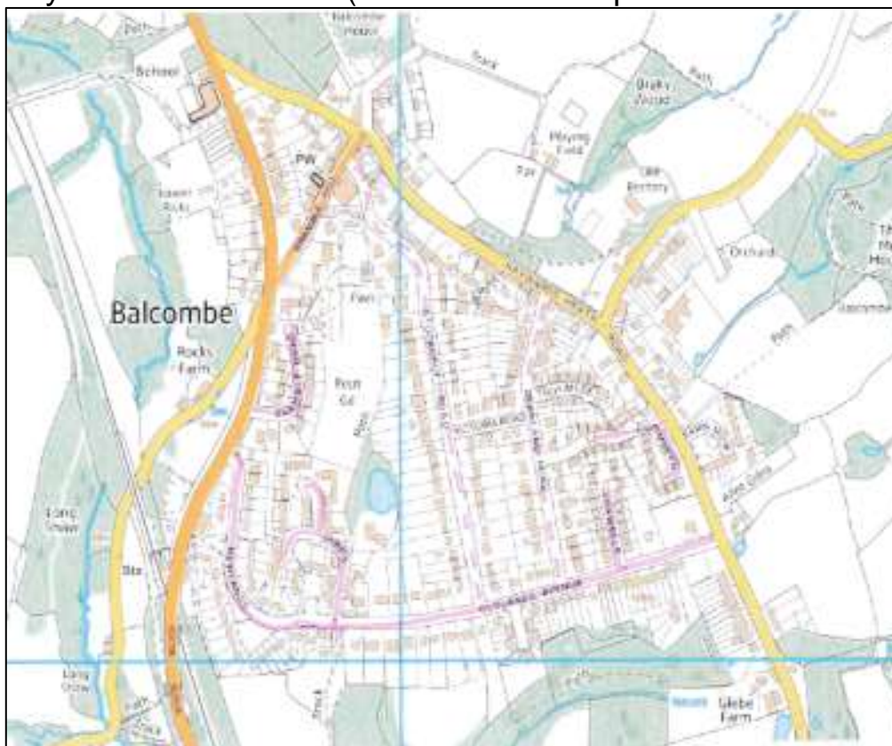
Roads to be gritted