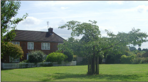
5. Alley Green