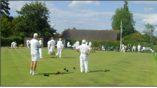
4. Bowling Green