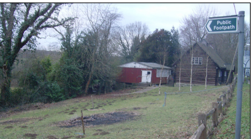
8. Scout Hut Amenity Space