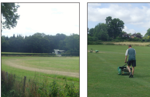
2. The Cricket Field