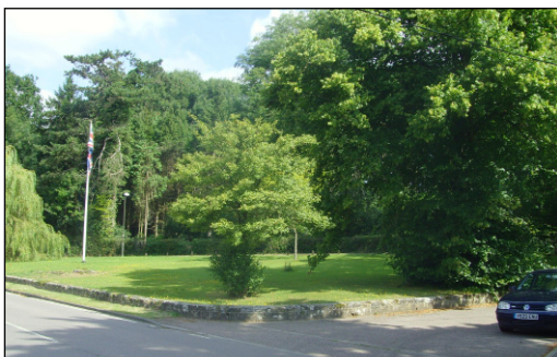
3. School Green