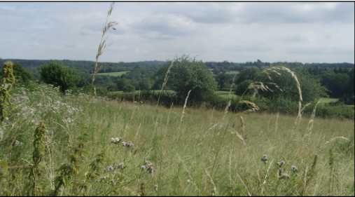
6. Bagpiths Field