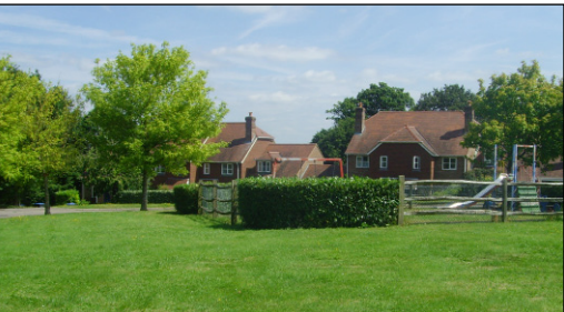
7. Barn Meadow Play Area