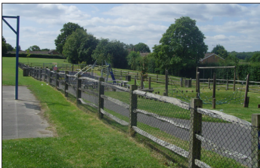
1. The Recreation Ground