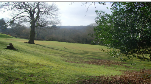
9. School Playing Field